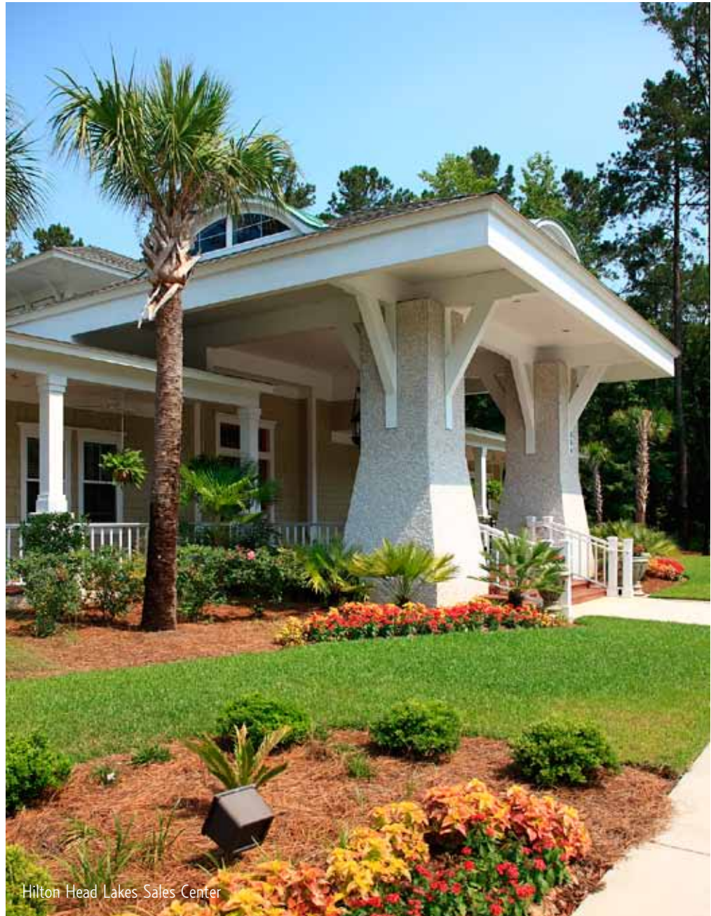
Hilton Head Lakes Sales Center

Lake Club at Hilton Head Lakes, Hardeeville, SC