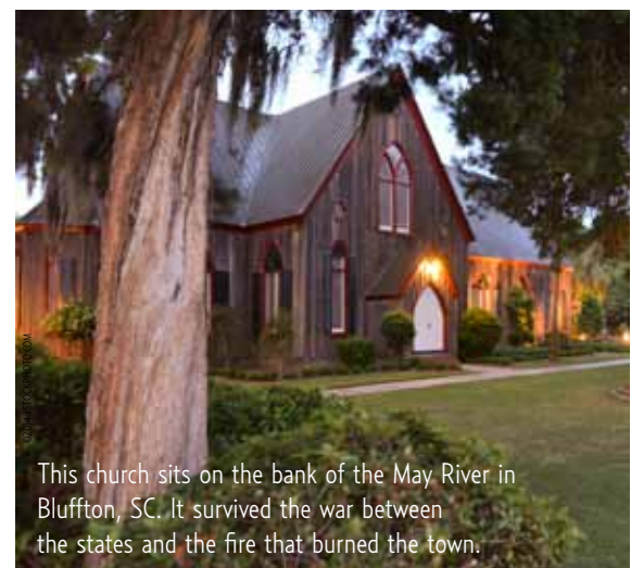
This church sits on the bank of the May River in Bluffton, SC. It survived the war between the states and the fire that burned the town.