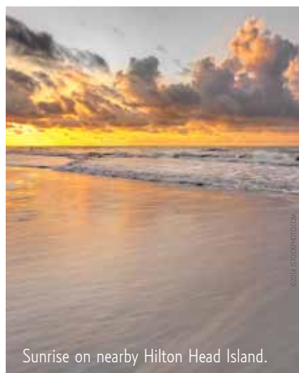
Sunrise on nearby Hilton Head Island.